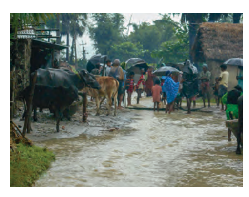
The central plain area of Nepal – where most of the BIC churches are congregated – experiences frequent flooding from excess rainfall.

Even this year at the time of lockdown due to the COVID-19 pandemic, BIC Church Nepal coordinated with the provincial Christian society to provide relief