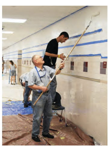
Service Opportunities.

Afternoon activities will include workshops, service opportunities, local tours, sports, Global Church Village and Anabaptist World Cup.