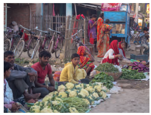
Brethren in Community Welfare Services helps farmers like through food security projects and vocational training programs.

Serving the community who are helpless and oppressed has always been part of BIC Church Nepal's mission since it was registered with the local government as Brethren in Community Welfare Society