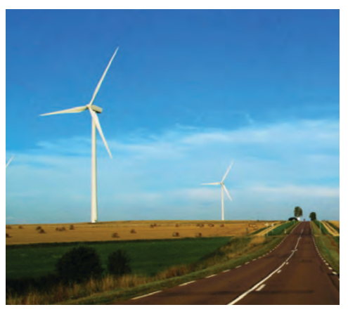
Catch the power of the wind of the Spirit.

At ancient Corinth, more wealthy church members ate plenty at communion while poor members (arriving late?) went hungry. Some became "weak and ill" and died. Those with resources brought judgement