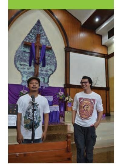
Assembly Scattered.

Following Jesus together across barriers.