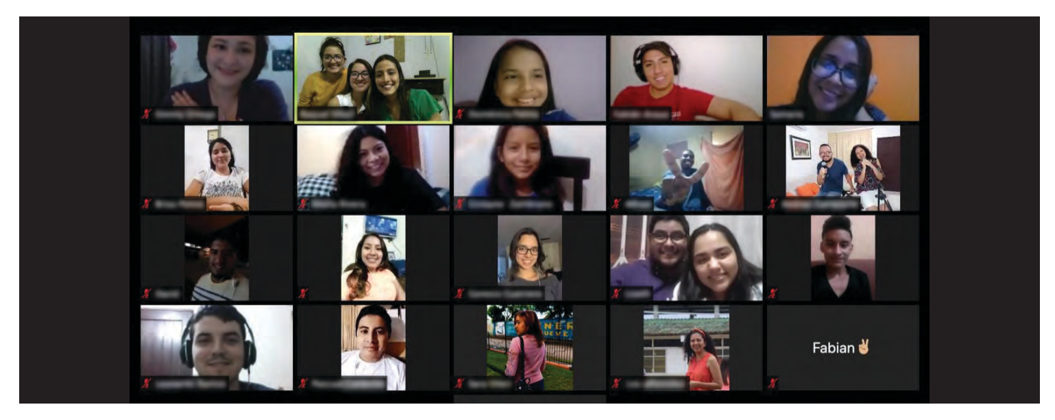
Like many churches, Mennonite young adults in Ecuador celebrated YABs Fellowship Week on Zoom during the pandemic.