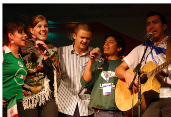
Learn about MWC's work.

To facilitate participation throughout the world, online workshops take place from 06:00-07:30 and 00:00-1:30 Semarang time. For help converting Indonesian time to your time zone, please search Semarang time in Google to find out the exact time in Semarang.