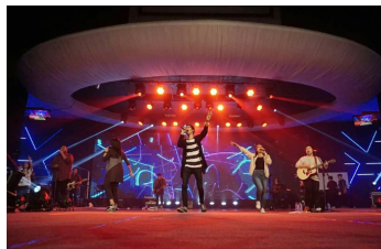
Host a "watch party" with your congregation, family or friends.

Following the main theme of Assembly, following Jesus together across barriers, each day focuses on a different facet of following Jesus.