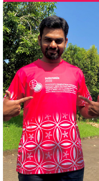
Many service opportunities.

To facilitate participation throughout the world, online workshops take place from 06:00-07:30 and 00:00-1:30 Semarang time. For help converting Indonesian time to your time zone, please search Semarang time in Google to find out the exact time in Semarang.