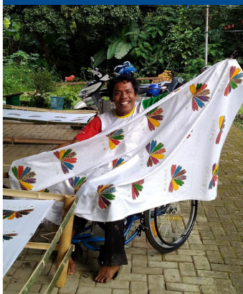
Many service opportunities

As an Assembly registrant, you can download all videos to facilitate playback qualities during watch parties. You retain access to all videos and articles until 30 September.