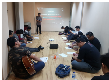
Attend a different workshop every day.